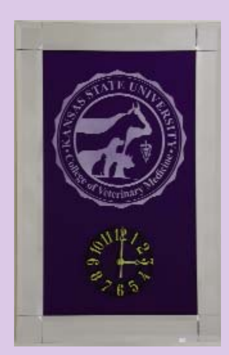
CVM logo clock Size: 16" x 24"