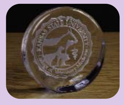
CVM logo crystal