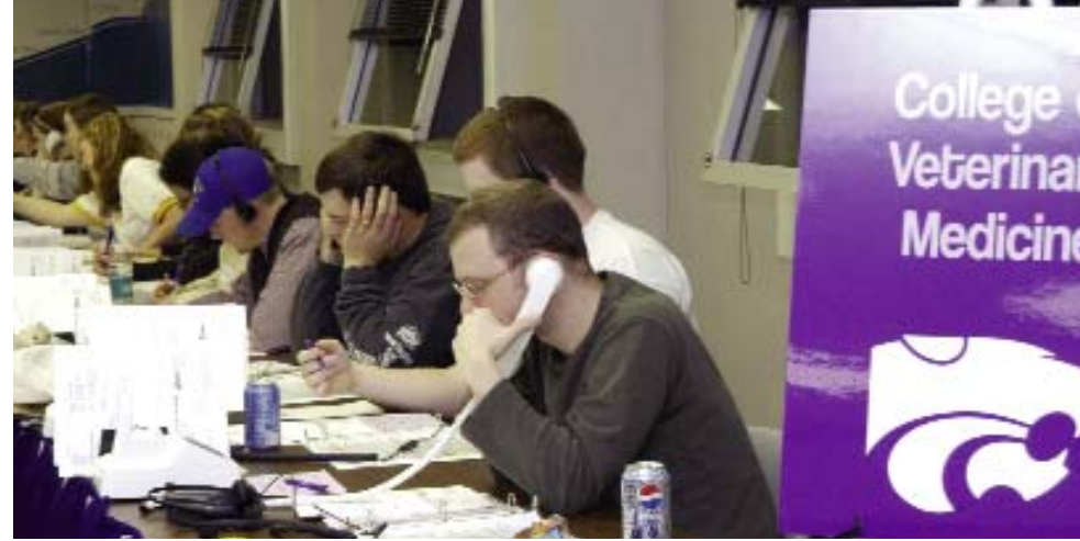
CVM students call alumni during Telefund 2008.

The two-day effort resulted in $75,263 being generated from 636 pledges. Overall, Telefund 2008 raised $1.3 million for all colleges at K-State. CVM students earned a variety of prizes for participating this year. The College of Veterinary Medicine thanks all the students for volunteering and all the alumni and friends who gave generously to support scholarships in the college.