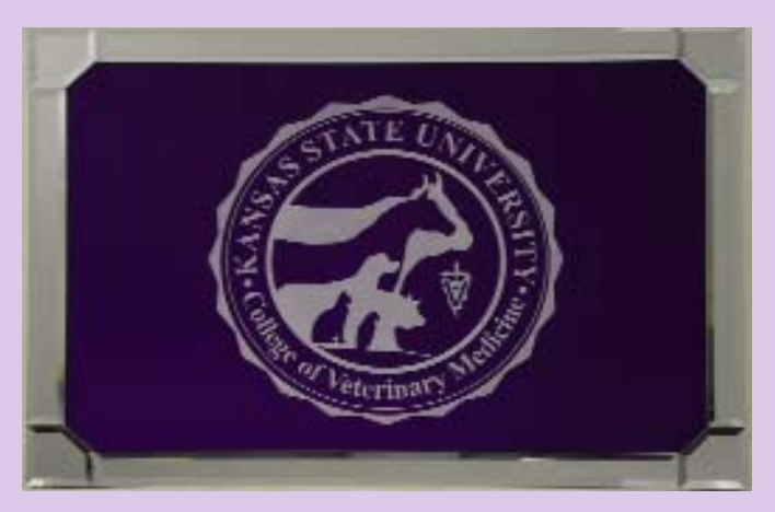
CVM logo mirror Available in two sizes: 39" x 27" and 24" x 16"