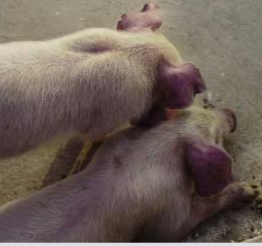
These pigs' blue ears indicate that they are stricken with blue-ear disease.