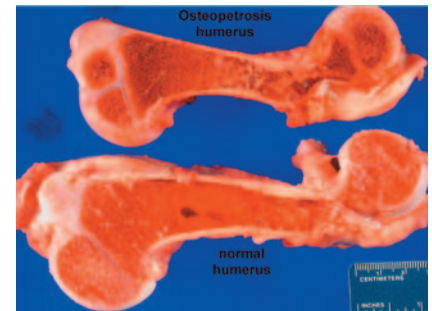
Figure 3: Osteopetrosis-like changes in a calf with BVD infection, the affected humerus (top) is shorter with a smaller marrow cavity and dense bone extending into the diaphysis, compared to a normal humerus (bottom).

Osteopetrosis-like lesions have been documented in calves infected in utero by bovine viral diarrhea (BVD) virus ( figure 3 ). Bovine viral diarrhea infection can cause several congenital defects including cerebellar hypoplasia, arthrogryposis, brachygnathia, and intrauterine growth retardation like the osteopetrosis calves; however, the gross and histologic changes in the long bones are different. There will not be total loss of the marrow cavity on cross section, although the bones in the metaphyses will be denser and there will be bands of increased bone density