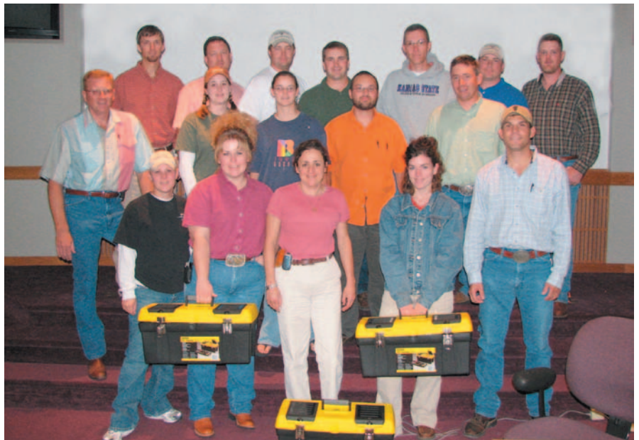
Advanced feedlot production medicine class, Kansas State University, Fall 2005.