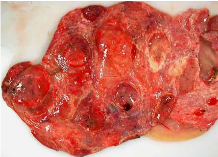
Figure 1. Diffusely edematous and thickened placenta. Intercotyledonary areas are covered with tan friable material.