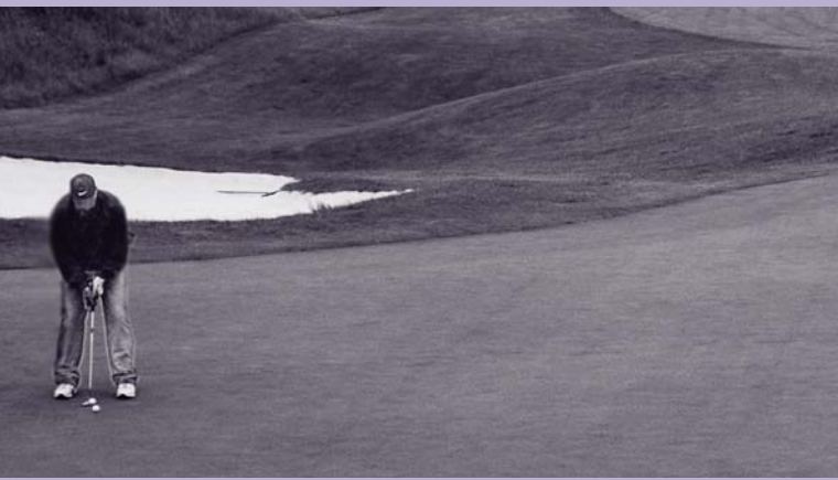
Colbert Hills Golf Course

Special recognition and kudos are in order for members of the Class of 2011. These members of the second year class have helped in event planning and their efforts on June 8 will ensure a successful tournament.